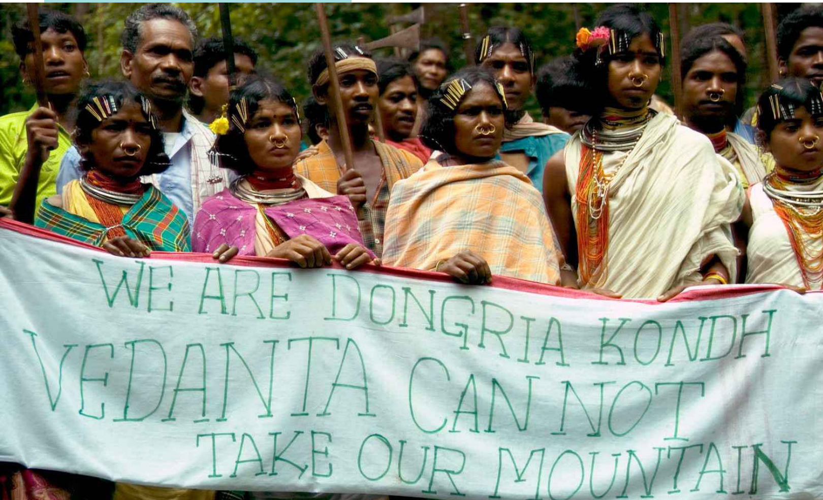
Members of the indigenous Dongria Kondh tribe demonstrate against a planned bauxite mine in the sacred Niyamgiri hills. The project by Vedanta Resources was ultimately stopped, in a landmark victory for tribal rights in India.

Even more troubling, the IFC's financial-sector clients have financed companies with well-documented track records of complicity in grave human rights abuses and environmental degradation.