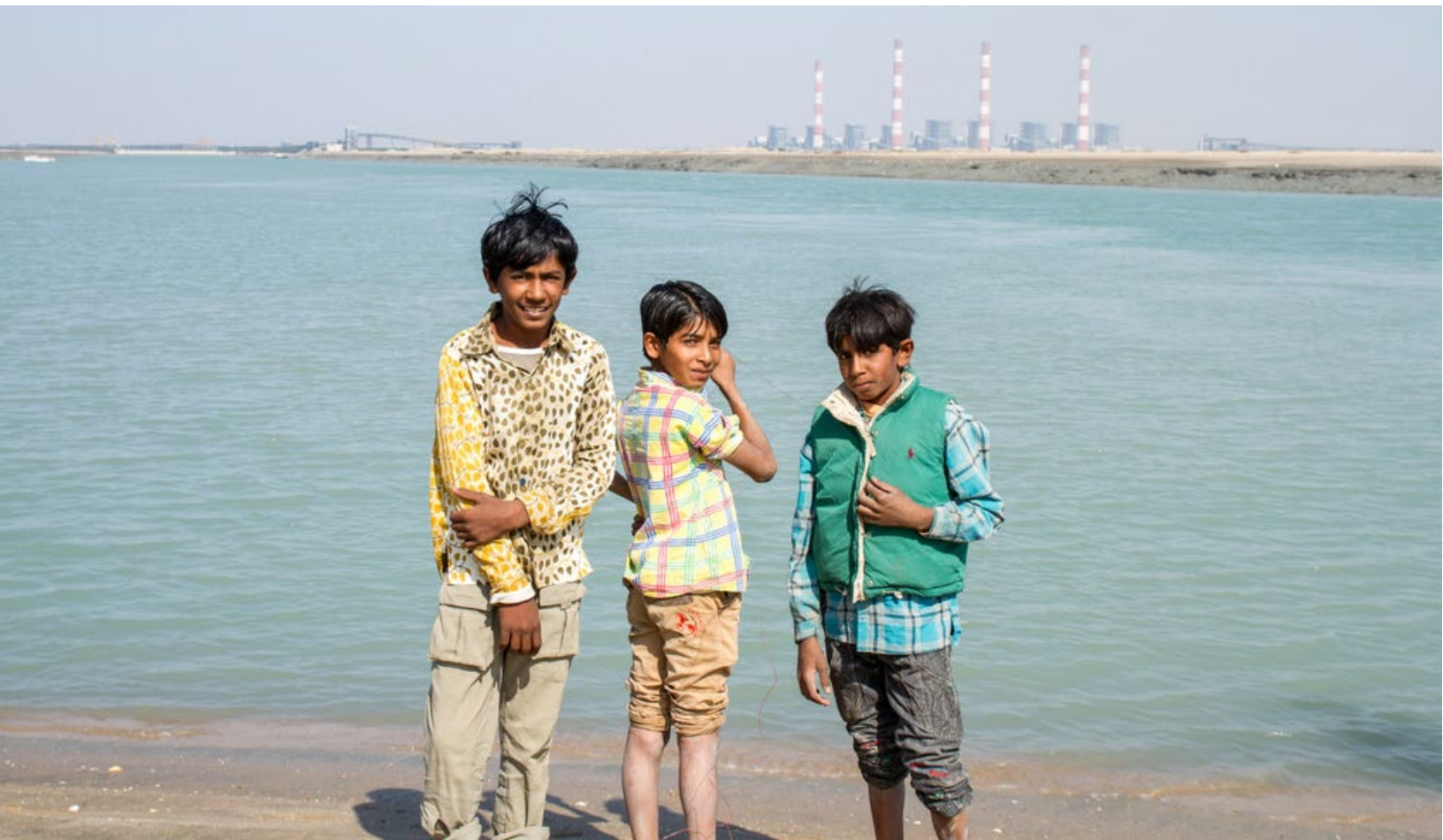
The Mundra complex, located in Gujarat state, includes a coal plant, port and special economic zone. It has polluted the ocean and displaced local fishing families. The IFC's commercial bank clients financed both the complex and the company that owns it, Adani.

financing from the IFC has instead received those funds through back channels.