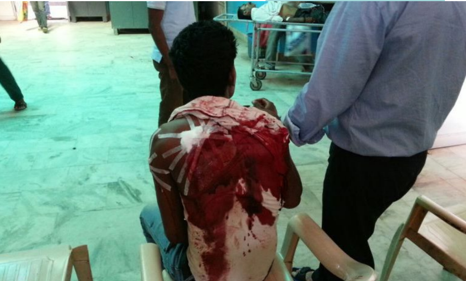
Five people were killed and at least 15 were seriously wounded when police opened fire on protestors opposed to a coal-mining project owned by NTPC Limited in Jharkhand state.

Track Record: NHPC's dams have reportedly displaced hundreds of thousands of Indian farmers, fishers, and indigenous people. The