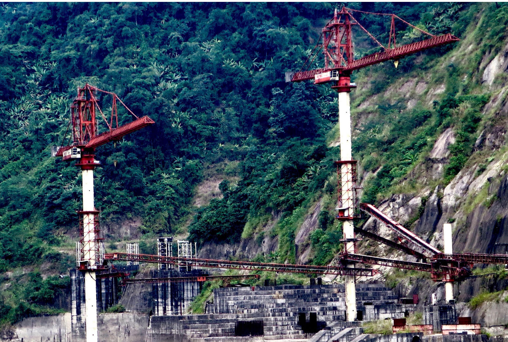
NHPC's planned Lower Subansiri project, which is being built in the Himalayan foothills, threatens the area's delicate biodiversity and the livelihoods of indigenous communities.

NHPC owns, either outright or through joint ventures, nearly two dozen large dams in India, with a number of others planned or being constructed. These dams have displaced hundreds of thousands of people, damaged crucial waterways and biodiversity, and provided few benefits to the people living near them. In many cases, communities affected by these projects have resisted their development. Regardless, NHPC has pressed forward, indifferent to the outcry.