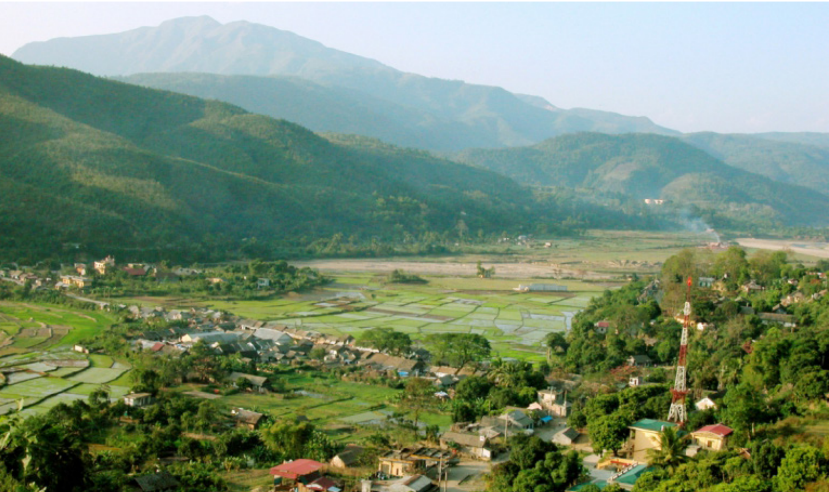
A village flooded by the reservoir of the Son La dam.

Vietinbank's reach extends beyond Vietnam. The bank has lent billions of dollars to Electricity Vietnam, which is part owner of a highly controversial dam in Cambodia, Lower Sesan 2, which will pro-