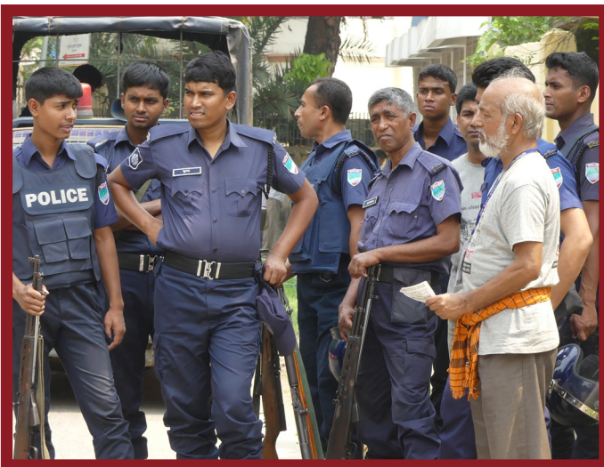
The authorities have cracked down on opponents of Rampal.

It is clear that without the participation of the IFC's commercial bank clients, including current clients Axis and Yes, NTPC would face immense difficulty in raising the capital it needs to conduct business. This gives the banks – and, in turn, the IFC – substantial leverage. As underwriters, they are in the position to demand the inclusion of social and environmental covenants in the securities they are shepherding to market. If NTPC were to refuse to include such covenants, the banks could decline to participate as underwriters, severely diminishing the company's access to the capital it needs to operate.