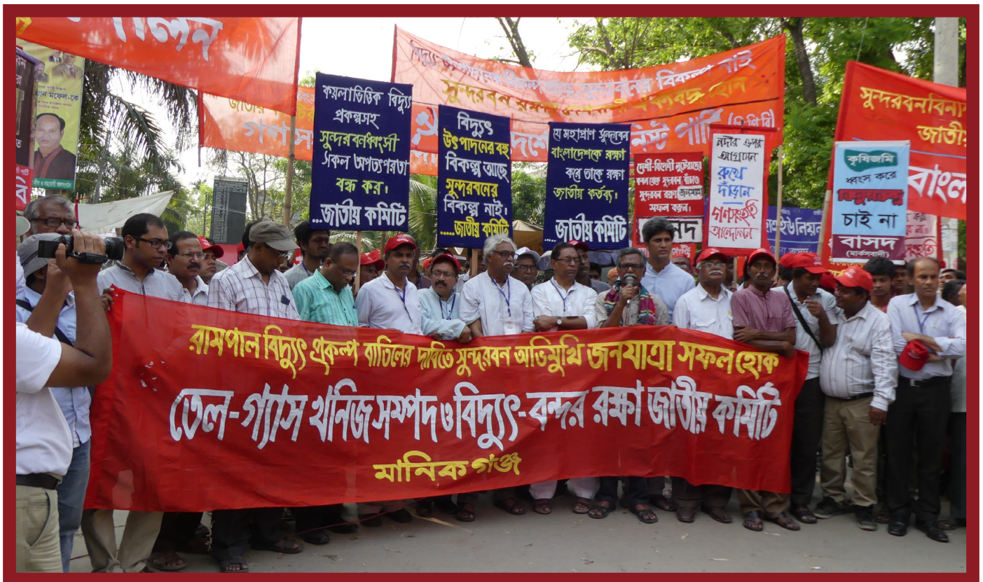
Members of the national committee prepare to march in Dhaka.

Finally, some of Japan's largest commercial banks, including Mizuho and Bank of Tokyo-Mitsubishi, have provided corporate loans, with few strings attached, to the Indian companies developing Rampal. The Japanese banks have provided this financing despite being signatories of the Equator Principles, a social and environmental risk management framework that is touted as the