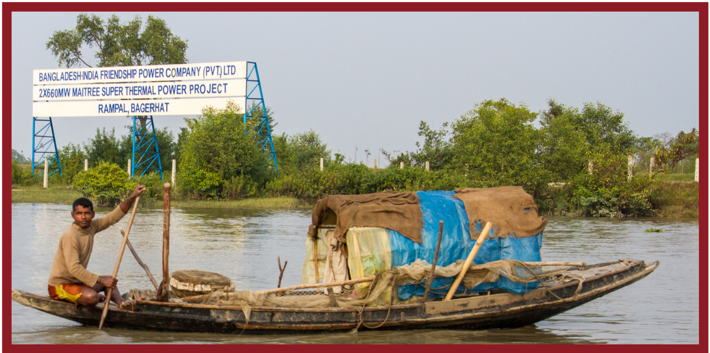
Rampal is expected to have disastrous impacts on the 2 million people who depend on the Sundarbans.

“These exits were planned for sometime, following improved market conditions in India,” the statement said. The IFC did not elaborate on what it meant by improved market conditions, nor would it specify precisely when it exited the investments. At the time, however, India’s economy was in turmoil due to the demonetization crisis. In the months following the Indian government’s decision to swap old currency notes for new bills, on November 8, 2016, the economy suffered a meltdown that saw contractions in a number of sectors, including manufacturing and real estate, and created cash shortages that disproportionately hurt the rural poor.