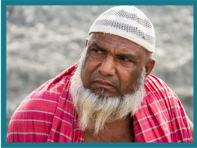
Some 2,000 families were displaced to make way for the Rampal plant. Most have left the area in search of menial work.

lamities. Every year, the monsoon rains join forces with dozens of rivers, swollen by melted Himalayan ice and snow, to submerge large parts of the country. The monsoon floods in 2007, described at the time as the worst in living memory, killed 1,100 people and damaged or destroyed 1.1 million homes. Cyclones are also a perennial worry. Last year, Cyclone Roanu unleashed a three-meter-tall wall of water that roared through seaside villages, killing dozens and causing extensive damage.