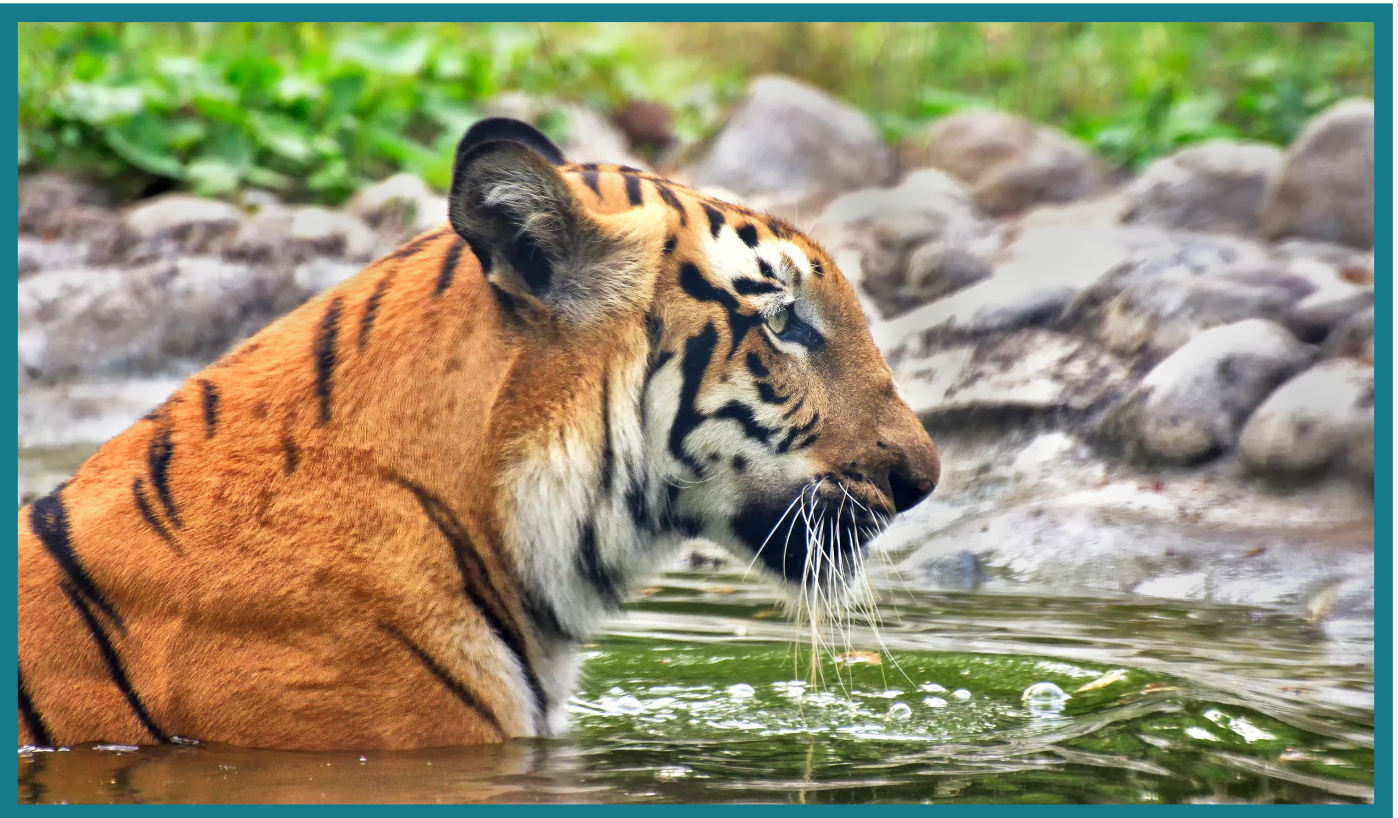
The Sundarbans is home to the world's largest remaining population of Bengal Tigers.

The cornerstone of these plans is Rampal, a planned 1,320-megawatt coal-fired power plant that will sit just 14 kilometers from the edge of the forest. The plant threatens to cause irreversible damage to the Sundarbans. It will pollute the forest's air and water with toxic coal ash, disturb its delicate ecosystem with increased shipping traffic and river dredging, and expose it to large-scale, potentially catastrophic industrial accidents, according to independent assessments. UNESCO, which designated a portion of the Sundarbans a