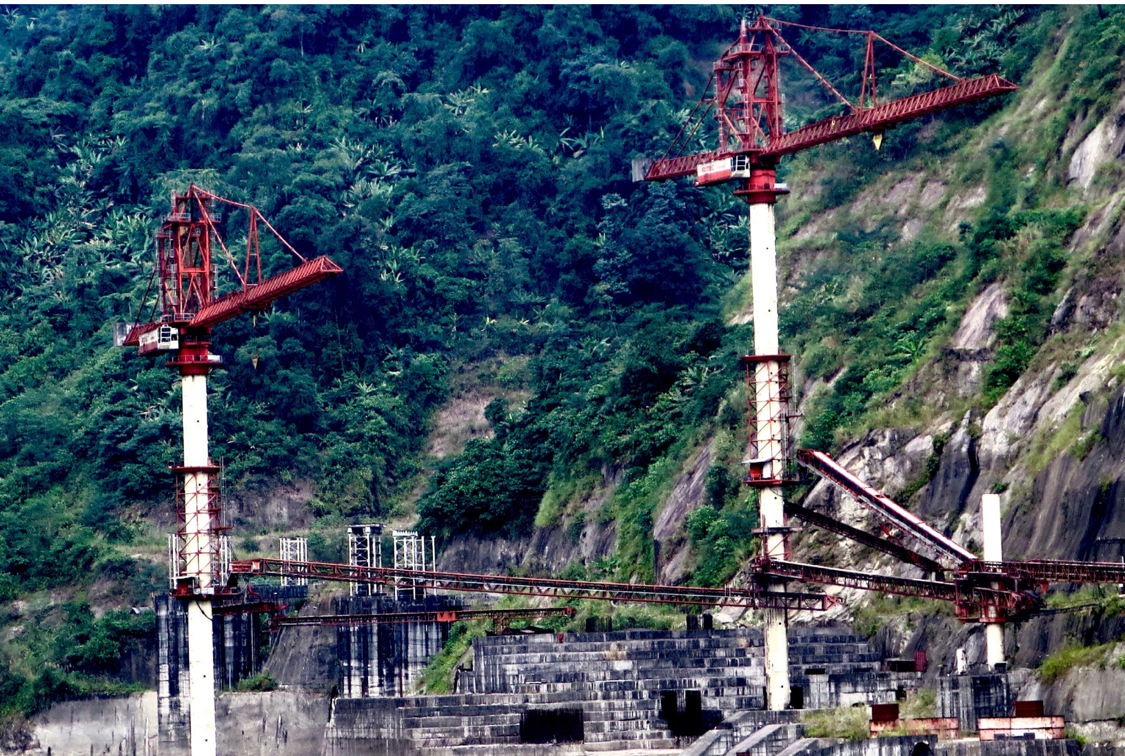
NHPC's planned Lower Subansiri project, which is being built in the Himalayan foothills, threatens the area's delicate biodiversity and the livelihoods of indigenous communities.

NHPC owns, either outright or through joint ventures, nearly two dozen large dams in India, with a number of others planned or being constructed. These dams have displaced hundreds of thousands of people, damaged crucial waterways and biodiversity, and provided few benefits to the people living near them. In many cases, communities affected by these projects have resisted their development. Regardless, NHPC has pressed forward, indifferent to the outcry.