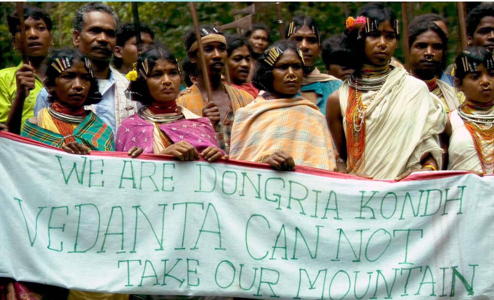
Members of the indigenous Dongria Kondh tribe demonstrate against a planned bauxite mine in the sacred Niyamgiri hills. The project by Vedanta Resources was ultimately stopped, in a landmark victory for tribal rights in India.

Even more troubling, the IFC's financial-sector clients have financed companies with well-documented track records of complicity in grave human rights abuses and environmental degradation.