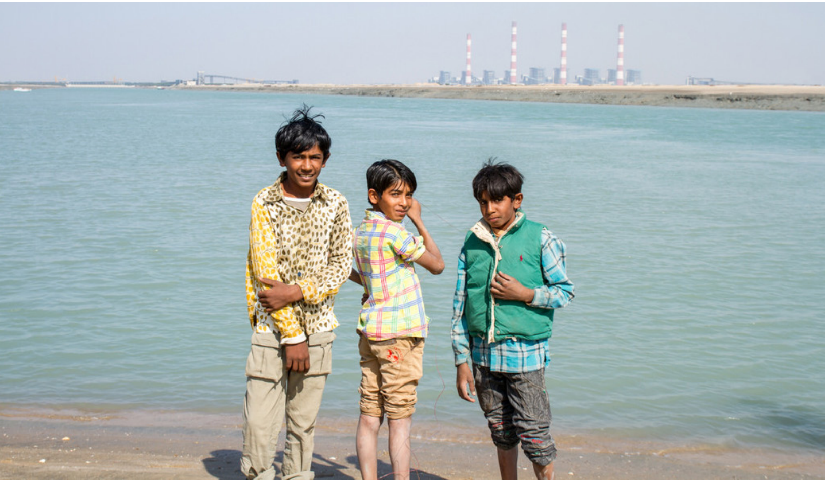
The Mundra complex, located in Gujarat state, includes a coal plant, port and special economic zone. It has polluted the ocean and displaced local fishing families. The IFC's commercial bank clients financed both the complex and the company that owns it, Adani.

financing from the IFC has instead received those funds through back channels.